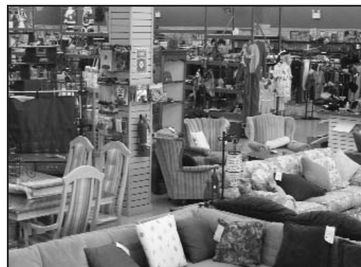
Liberty Ministries new Pottstown thrift store is now open to the public. It is the largest of Liberty's 4 stores.

You become part of Liberty Ministries by volunteering, dropping off donated items and making purchases. You are helping to offer the message of grace, hope and regeneration through the love of Jesus Christ to prisoners and ex-prisoners. If you'd like to know more simply log on to the Liberty Ministries web site at www.libertyministries.us and click "stores."