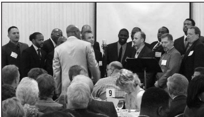
The men of Liberty joyously worshiping God along with more than 400 banquet attendees

Thank you, thank you, thank you to all of you, our faithful supporters, for making Liberty Ministries' 26 th Annual Fundraising Banquet the most successful banquet in our history! Over 400 people attended this wonderful event hosted at the Franconia Heritage Restaurant. The food, served family style, was absolutely delicious and plentiful! The presence of the Lord was evident as we worshiped with the men of Liberty House and the worship team from Living Faith Fellow-